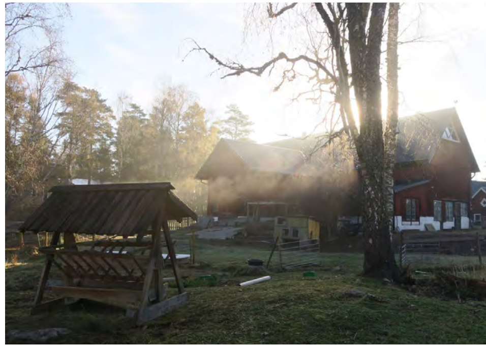
Blossom together with the cycle of nature