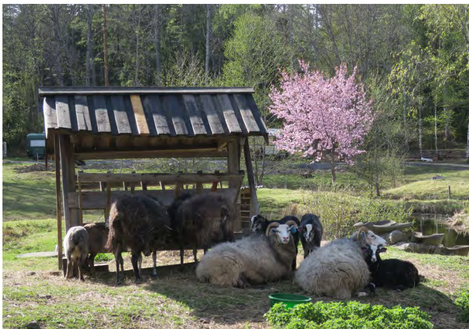
Care and connect with the farm animals