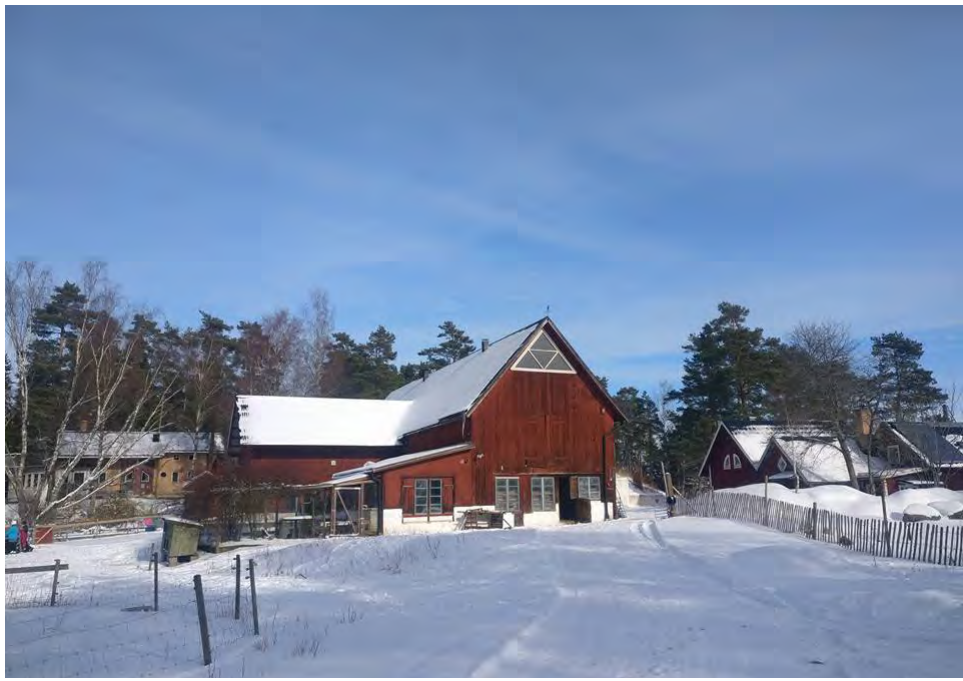
Enjoy the cold and crisp Nordic winter