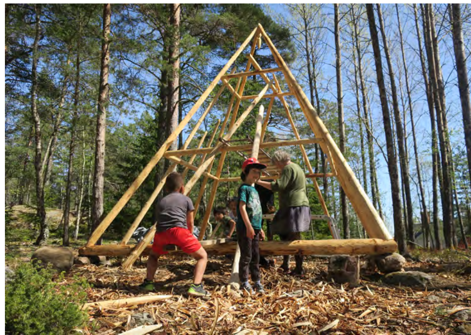
Create and play together with children