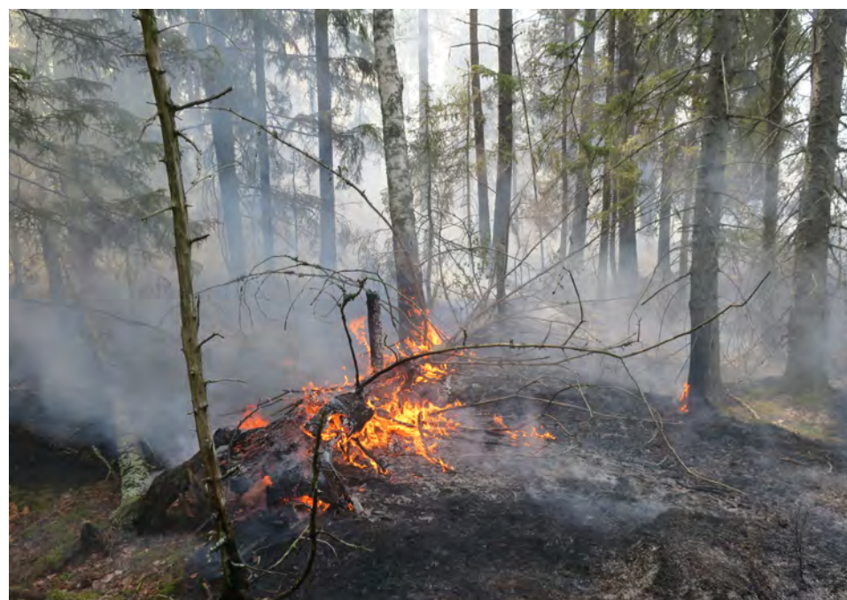
Learn to take on the many challenges in life