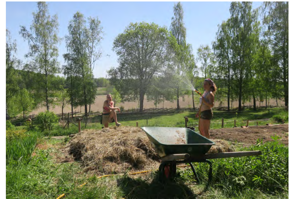
Practice permaculture and grow your food