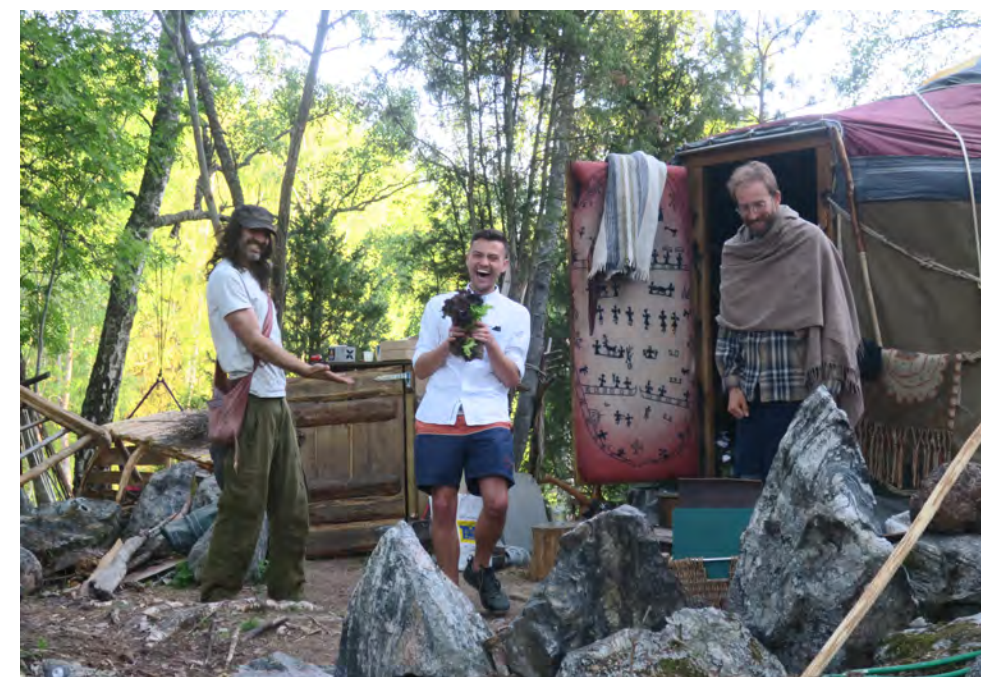
Share lots of beautiful moments together