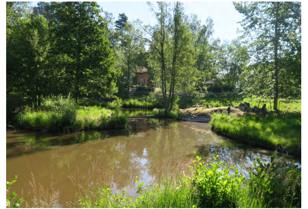
Experience the lush and beautiful summer