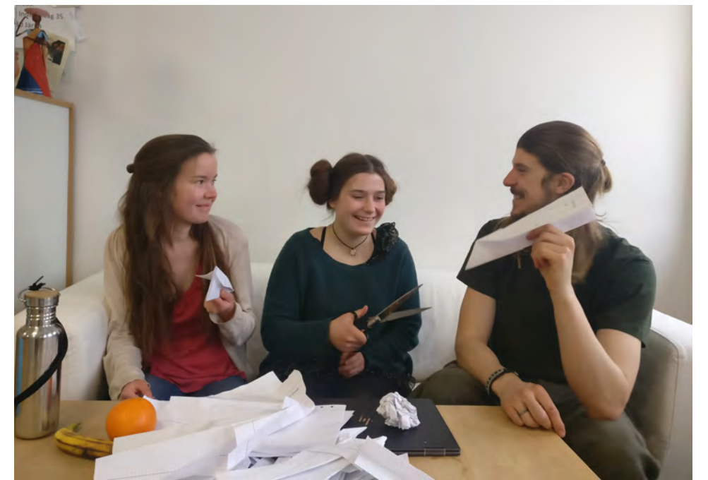
Help different sustainability projects