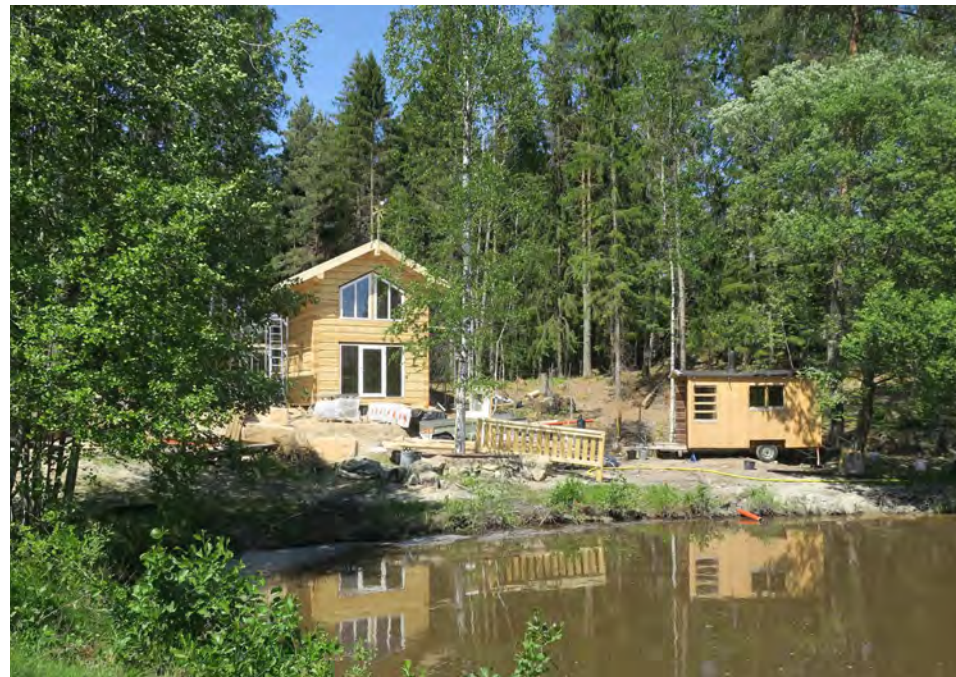
Be a part of building a base for volunteers