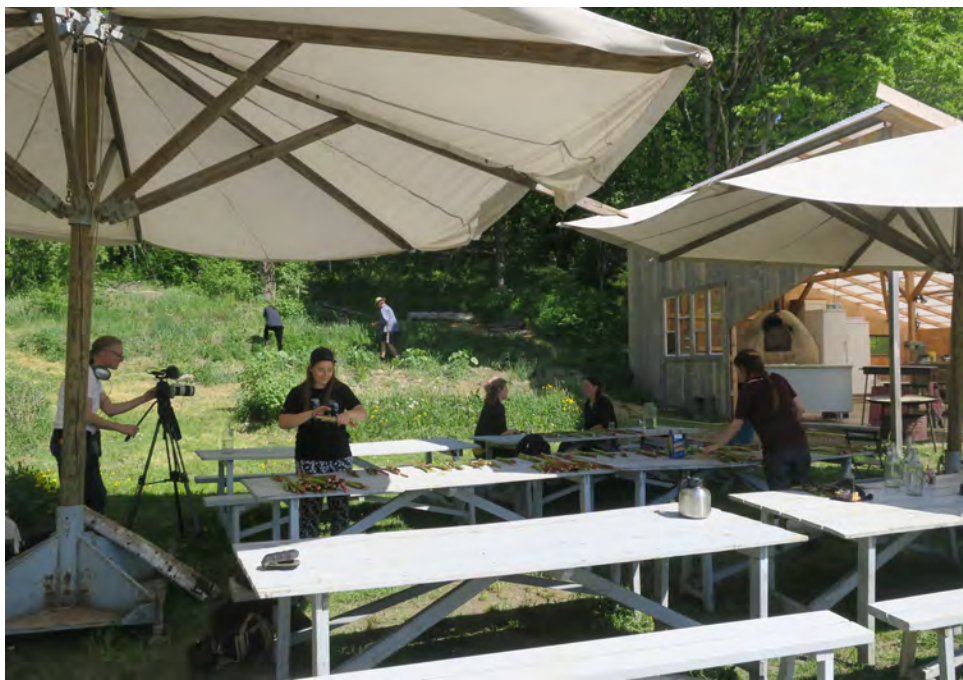
Volunteer at Under Tallarna (CSA)